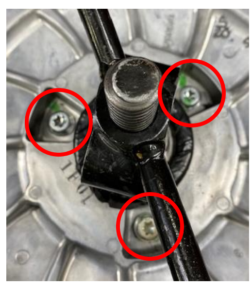
Figure 2 Figure 1