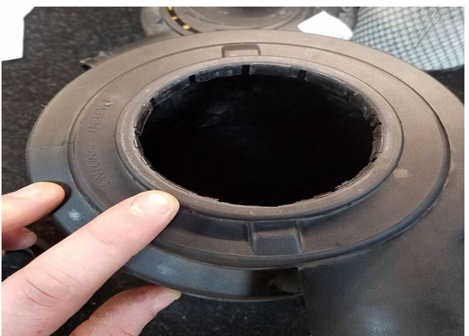
Step 10: Once the end cap is removed, use fine grit sandpaper to smooth any ridges and roughen up the surface. Slide the included foam gasket up against the flange of the V Flow Intake – this will seal the area between the V Flow Intake and the OEM filter canister.