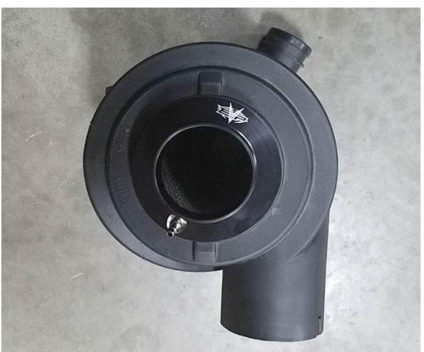
Step 11: Align the EVP V-Flow intake as shown below.