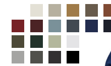
STENCIL HOODIE AS COLOUR