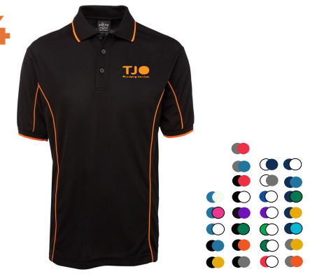
S/S PIPING POLO JB's Wear

Catalogue is where we choose one of the wholesaler's catalogue items and decorate with your club logo (embroidery or print). This is most popular with small orders and time sensitivities with a Minimum order (MOQ) of 10-20 per item and a turn-around time of 2 weeks.