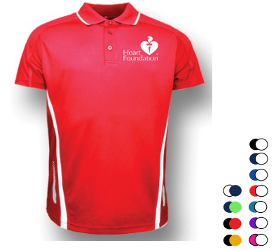
ELITE POLO Bocini