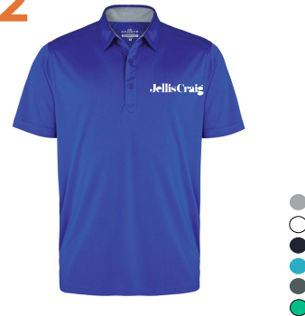
DUKE POLO Sporte Leisure