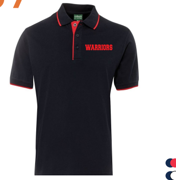
C OF C TIPPING POLO JB's Wear