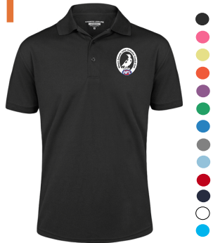
AERO POLO Sporte Leisure