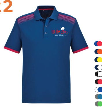
GALAXY POLO Biz Collection