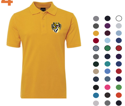
THE SIGNATURE POLO JB's Wear