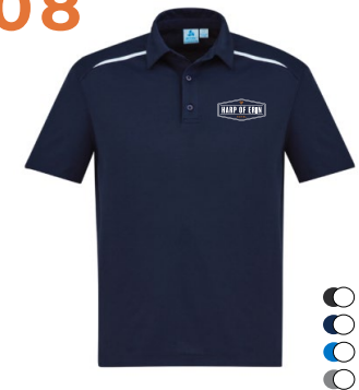
SONAR POLO Biz Collectionv

Catalogue is where we choose one of the wholesaler's catalogue items and decorate with your club logo (embroidery or print). This is most popular with small orders and time sensitivities with a Minimum order (MOQ) of 10-20 per item and a turn-around time of 2 weeks.