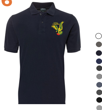
C OF C PIQUE POLO JB's Wear