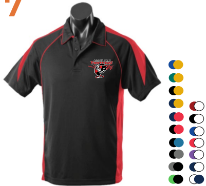
PREMIER POLO Aussie Pacific