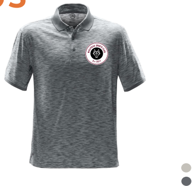
THRESHER PERFORMANCE POLO Legend Life