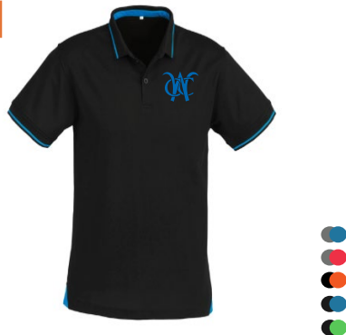
JET POLO Biz Collection