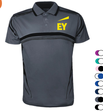
SUBLIMATED GRADATED POLO Bocini