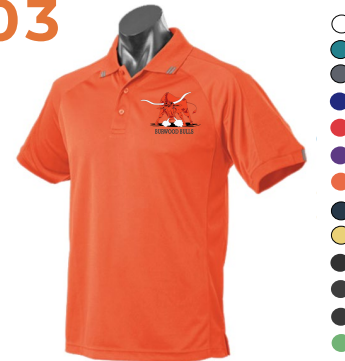
FLINDERS POLO Aussie Pacific