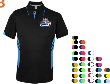
TASMAN POLO Aussie Pacific