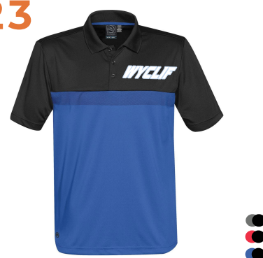
EQUINOX POLO Legend Life