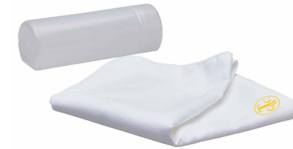
M200 SPORTS TOWEL IN CONTAINER Legend Life