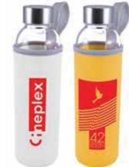
CAPRI GLASS BOTTLE WITH NEOPRENE SLEEVE Logo Line