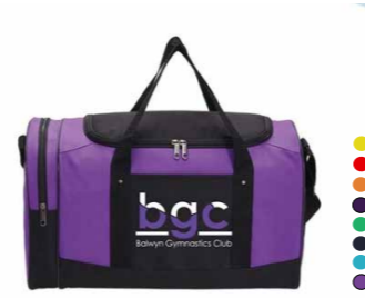
SPARK SPORTS BAG Legend Life