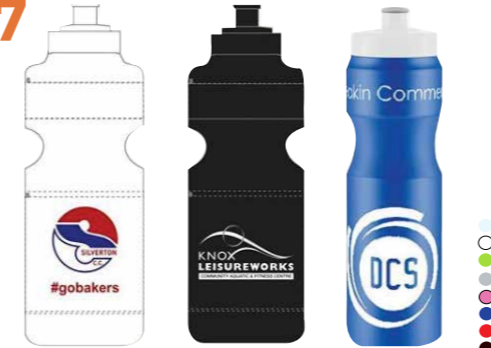
ESSENTIALS 750ML MN750SS Drink Bottles Range