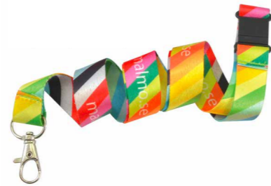
AZURE SUBLIMATED LANYARD Logo Line