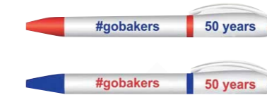
JP002 PLASTIC PEN JS Supplies