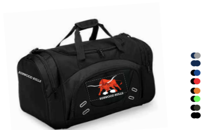
FORCE SPORTS BAG Legend Life