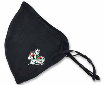
COMFORT FACE MASK Logo Line