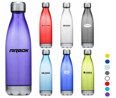
HIKE STAINLESS STEEL DRINK BOTTLE Logo Line