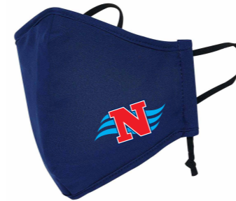
CMK-2 PERFORMANCE REUSABLE FACE MASK Legend Life