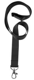
ARTEMIS WOVEN LANYARD Logo Line