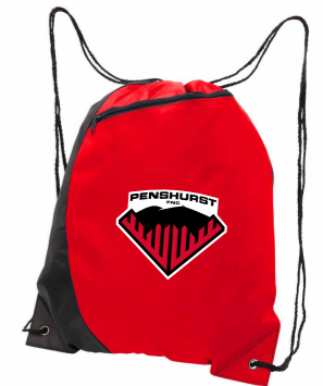
ICON BACKSACK Legend Life

Catalogue is where we choose one of the wholesaler's catalogue items and decorate with your club logo (embroidery or print). This is most popular with small orders and time sensitivities with a Minimum order (MOQ) of 10-20 per item and a turn-around time of 2 weeks.