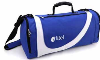
SPORTS BAG Grace Collection

Catalogue is where we choose one of the wholesaler's catalogue items and decorate with your club logo (embroidery or print). This is most popular with small orders and time sensitivities with a Minimum order (MOQ) of 10-20 per item and a turn-around time of 2 weeks.