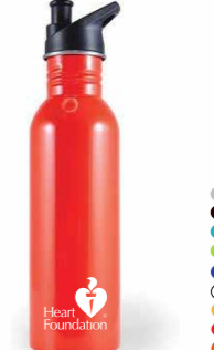
HIKE STAINLESS STEEL DRINK BOTTLE Logo Line