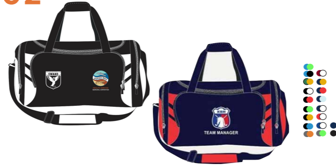
TASMAN SPORTS BAG Aussie Pacific