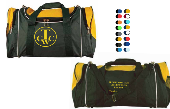
B2020 WINNER SPORTS BAG Winning Spirit