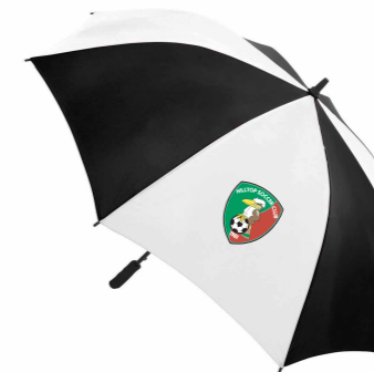
UMBRA - GUSTO Legend Life