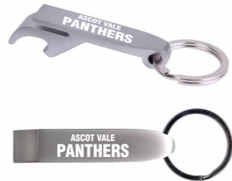
SKOL BOTTLE OPENER / KEYTAG Logo Line