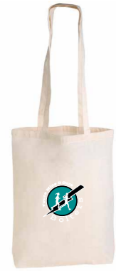
CALICO LONG HANDLE BAG Logo Line