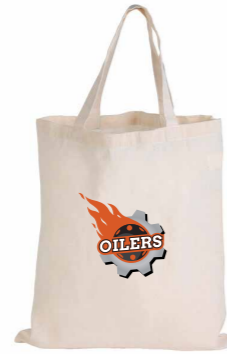
CALICO SHORT HANDLE BAG Logo Line