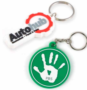
RIVIERA KEYTAG Logo Line