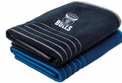
M140 REVERSIBLE TWO-TONE TOWEL Legend Life