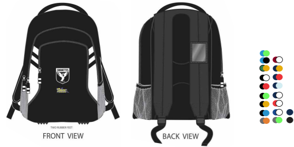
TASMAN BACKPACK Aussie Pacific