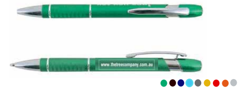
MIAMI PEN Logo Line