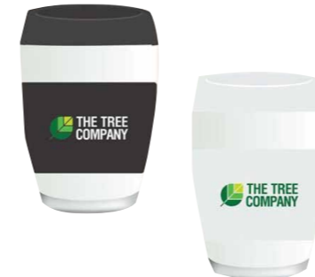
LATTE CUP Drinks Bottle Range