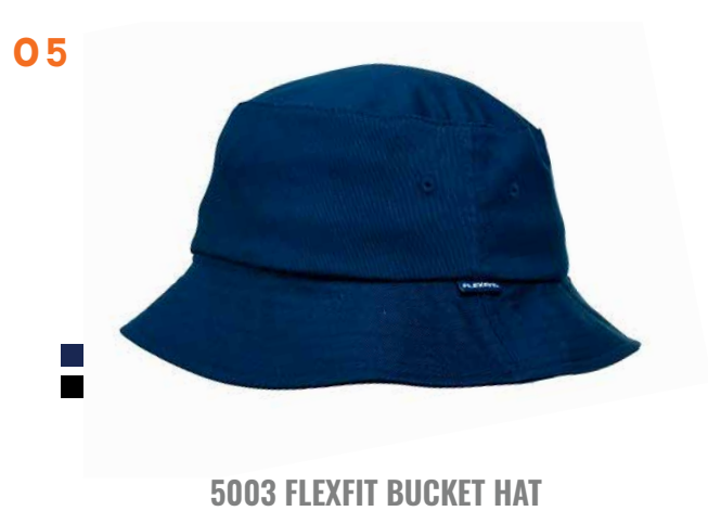
5003 FLEXFIT BUCKET HAT Macleod Scotland

Our catalogue wholesaler range (locally held) has a variety of bucket hat options. If you're opting for a classic approach, have time sensitivities or a small order this is the choice for you, with the minimum order (MOQ) of 20 per item and a turn-around time of appoximately 2 weeks.