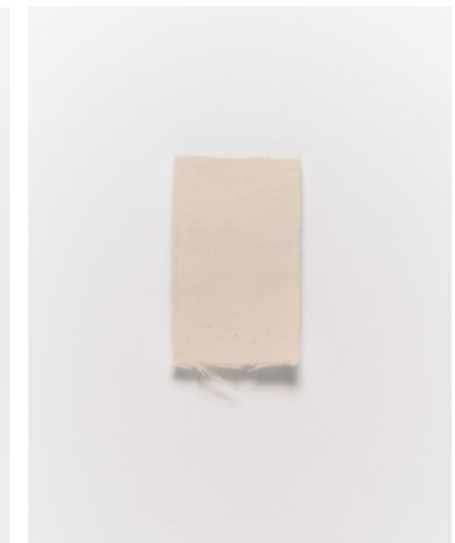
06 LATEX RUBBER ELASTIC