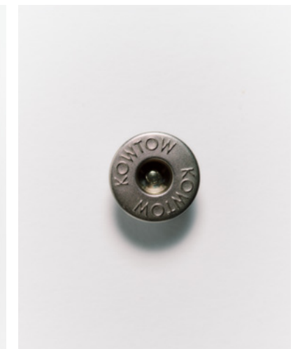
09 METAL TACK