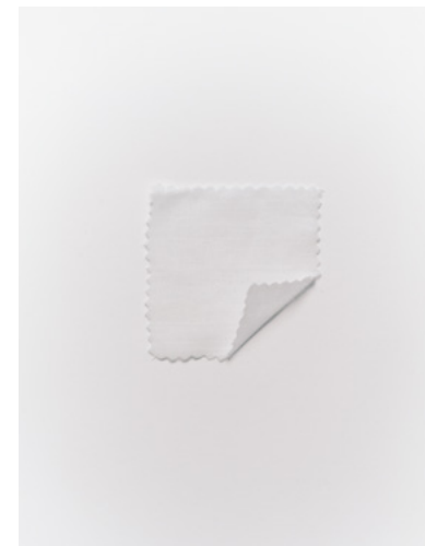
04 COTTON INTERLINING