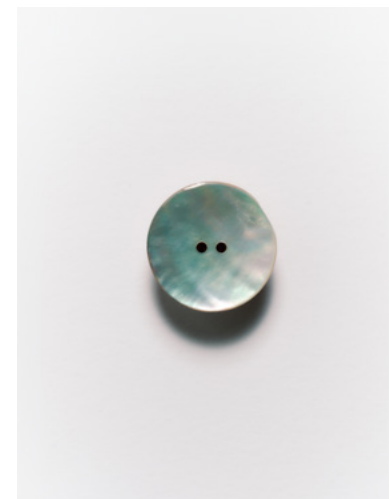
07 SHELL BUTTON