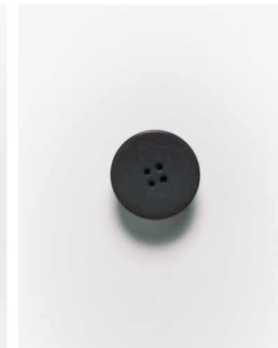
08 NUT BUTTON