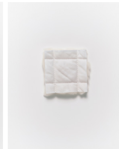
05 COTTON WADDING