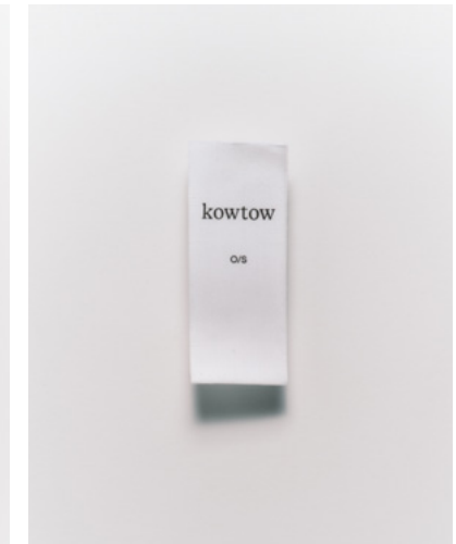
03 COTTON LABELS