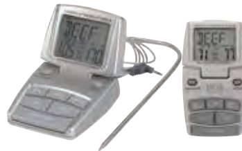
Digital Meat Thermometer 829184 - DT100