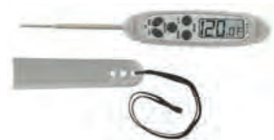
Waterproof Pocket Thermometer 831068 - DT131