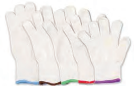
Cut Resistant Gloves GL100 - 805200 GL101 - 807928 GL102 - 807929 GL103 - 807930 GL104 - 807931