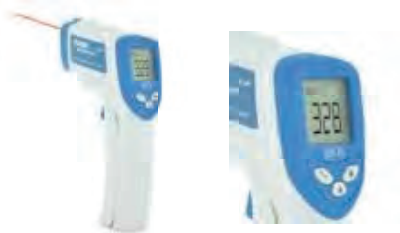
Infrared Thermometer 849004 - PS199