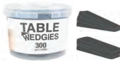
Table Wedgies (300 pk) 810753 - 325SC

Are you ready? BIOS Professional has the tools!