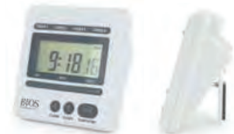
4-in-1 Kitchen Timer 830681 - DT145