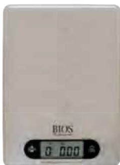
Portion Control Scale 821045 - 600SC