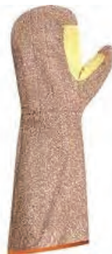
CoolGrip® 17" Heavy-Duty Fully Lined Terry Cloth Mitts with Oilbloc™ 814743 - SGN550