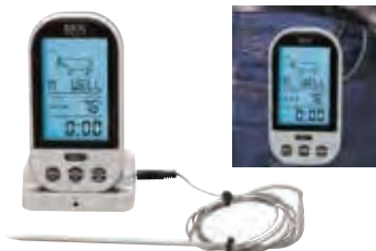
Wireless Meat Thermometer 831076 - 132HC