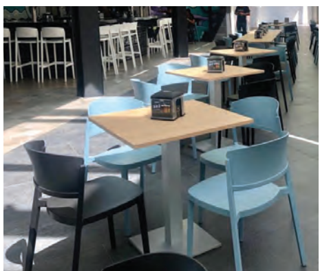
Abuela The Abuela chair is available as a bar stool, side chair, or armchair. All versions feature the same soft, elegant lines and unique design that is lightweight, easy to clean, and most importantly – comfortable!