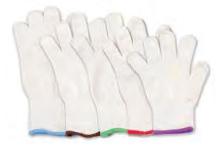
Cut Resistant Gloves

CoolGrip® 17" Heavy-Duty Fully Lined Terry Cloth Mitts with Oilbloc™ 814743 - SGN550