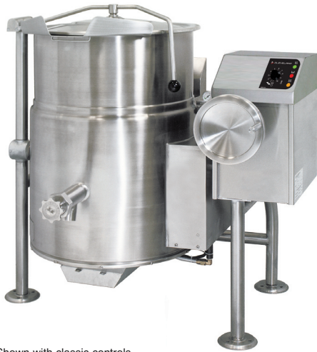
Shown with classic controls, optional Spring Assisted Cover and 2" Tangent Draw-Off Valve