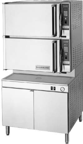
Shown with optional Electronic Timer