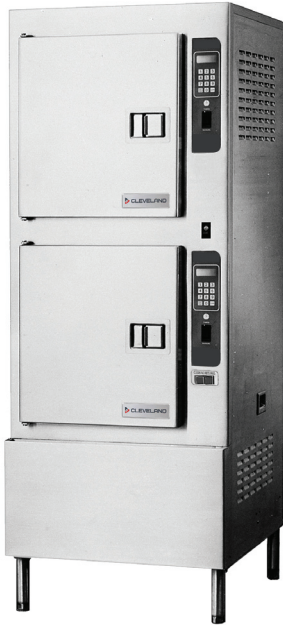
Shown with optional Electronic Timer