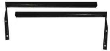
Cargo Box Brackets

Using a T45 Torx driver, remove four bolts holding factory bag attachment to rear strut assembly.