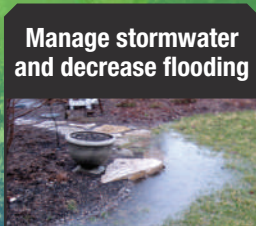
Manage stormwater and decrease flooding