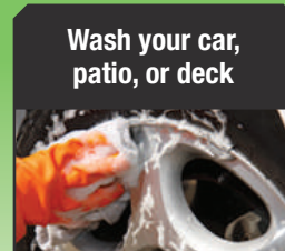
Wash your car, patio, or deck