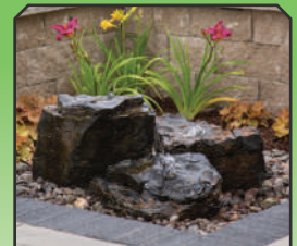
Enjoy a decorative water feature