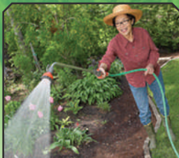
Water your lawn and flowerbeds

The Rainwater Harvesting System can be used in a variety of ways.