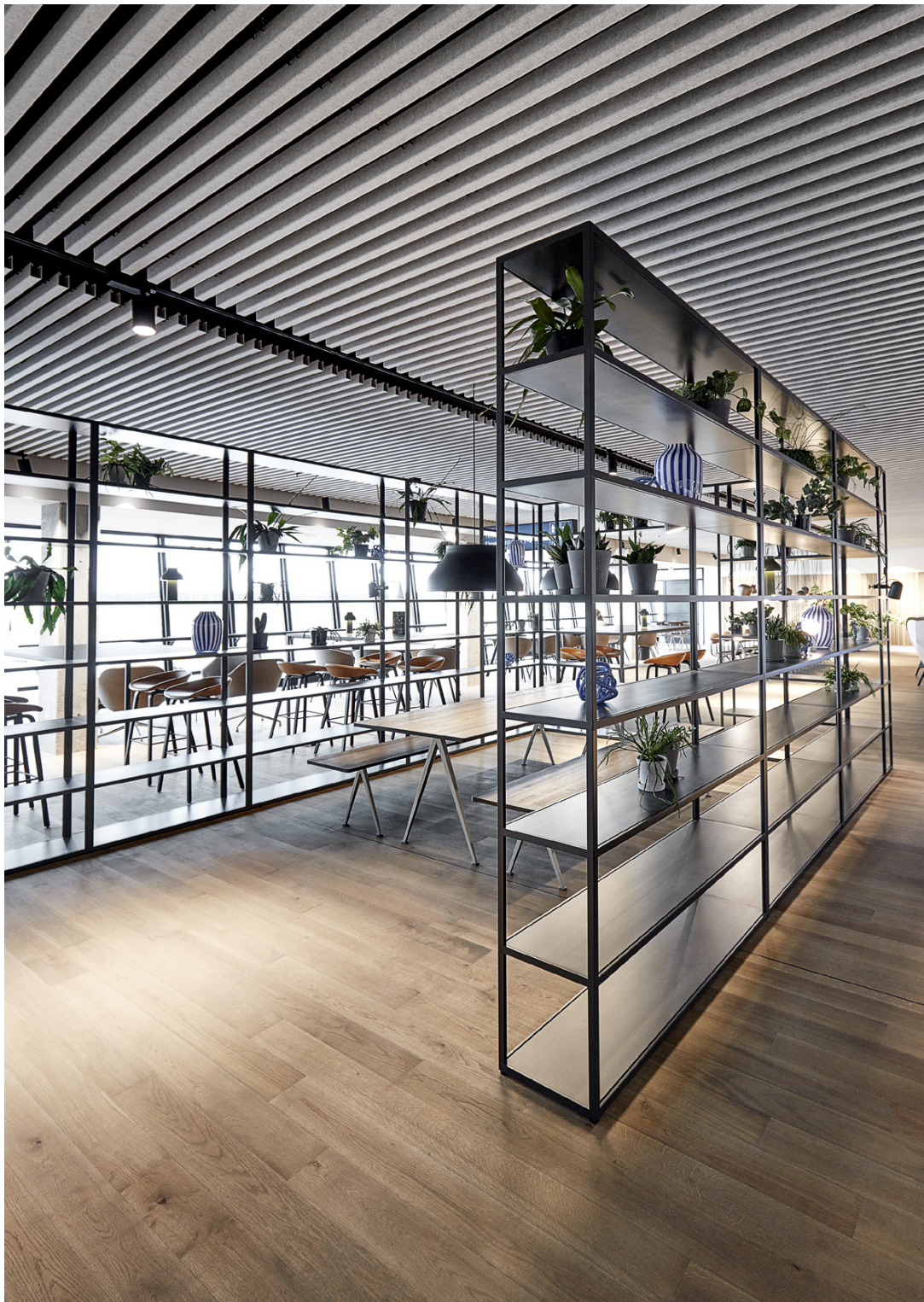
- SPACE DIVIDER -