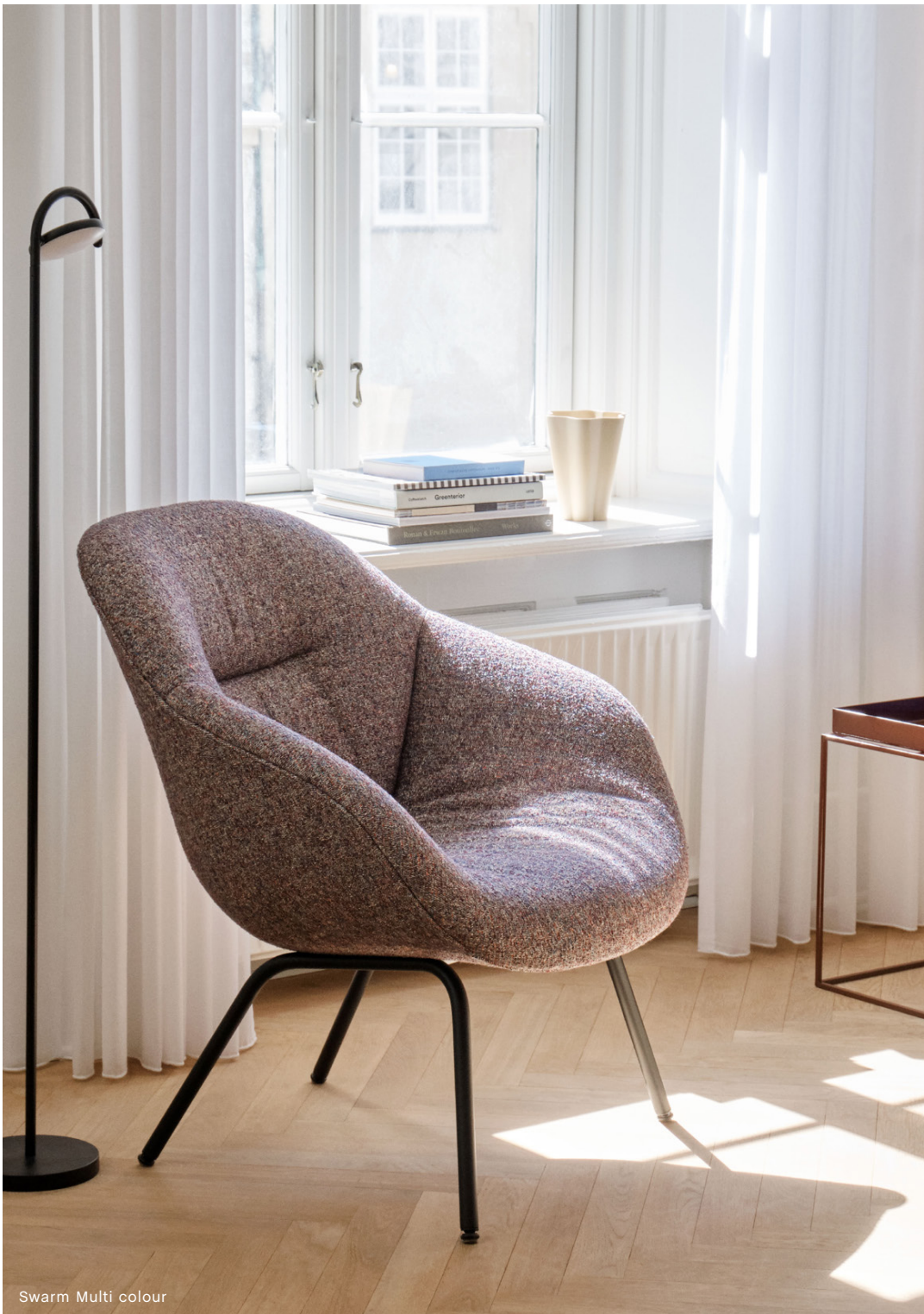
Swarm Multi colour