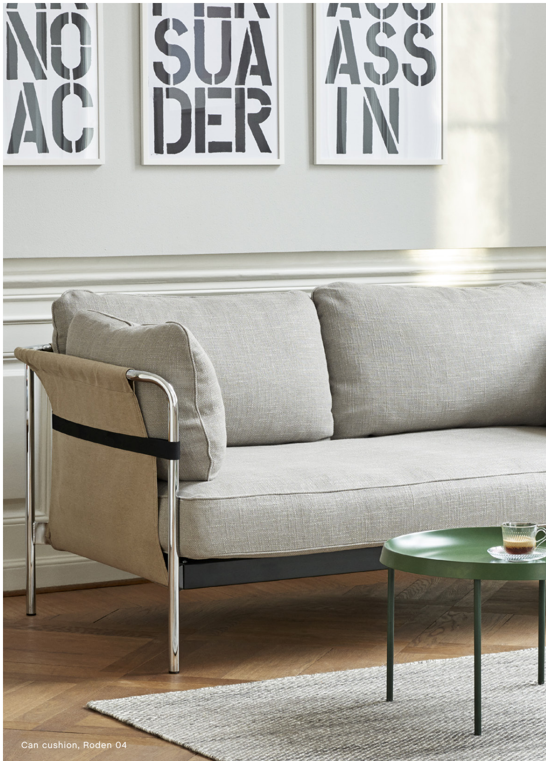
Can cushion, Roden 04