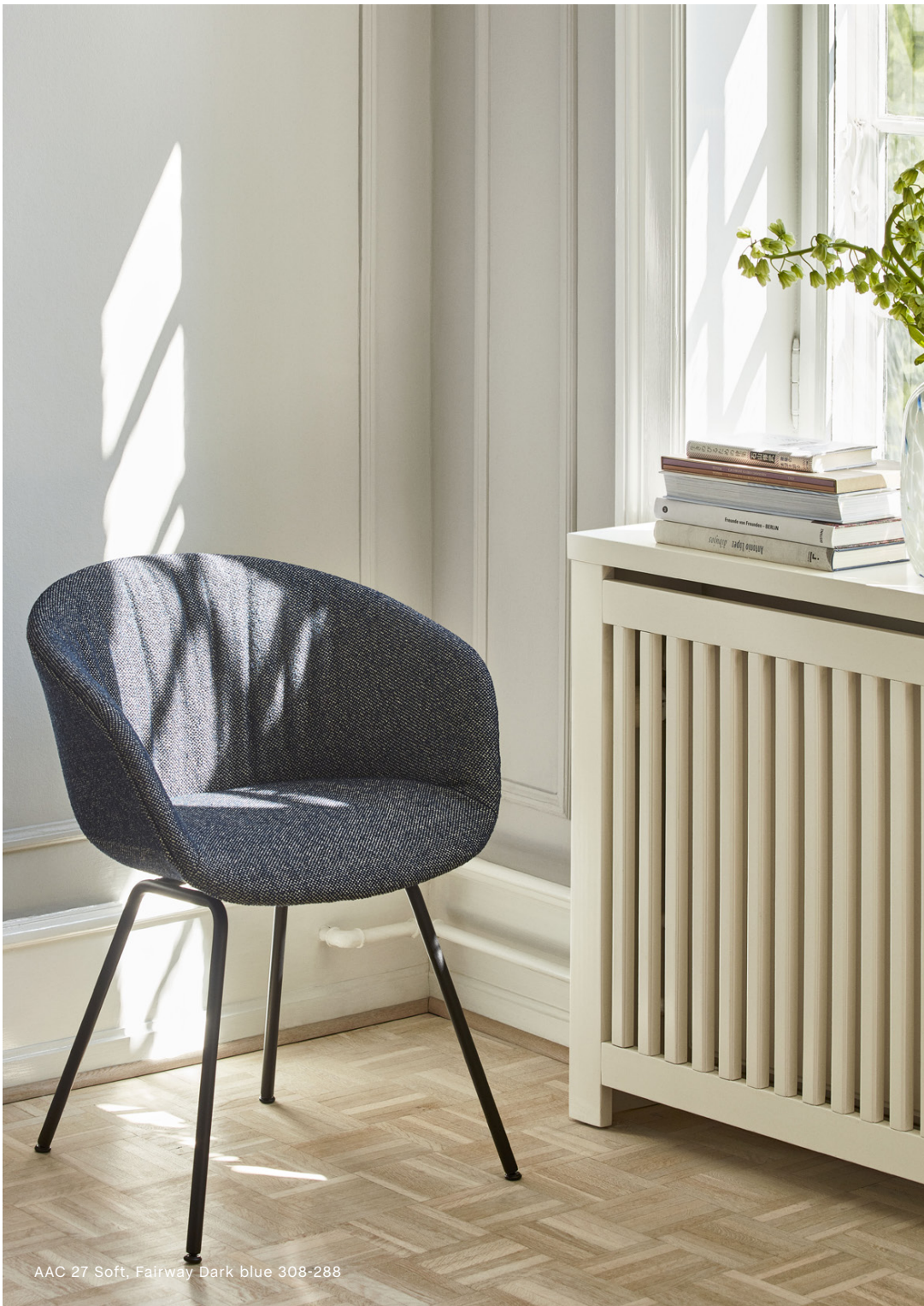
AAC 27 Soft, Fairway Dark blue 308-288