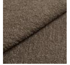
Fabric Barnum 8 Medium green 1025013