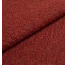
Fabric Barnum 23 Rust 1025016