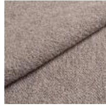
Fabric Barnum 14 Silver 1025006