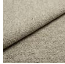
Fabric Barnum 2 Sand 1025012