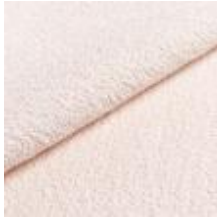
Fabric Barnum 24 Lana 1025015