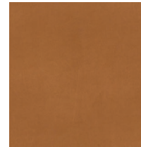
COGNAC - 21000