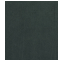
RACING GREEN - 21005