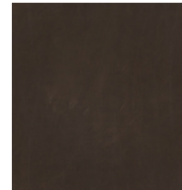
DARK BROWN - 21001