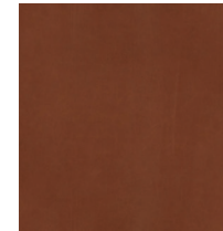
RUST - 21002