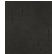
GREY - 21007