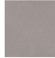
LIGHT GREY - 40782