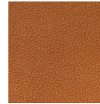
1513 KELATO WHISKY