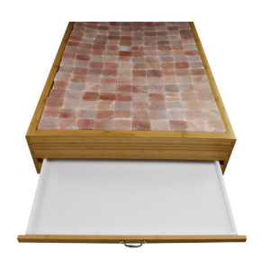
Convenient cleaning drawer allows you to sanitize the table between treatments.