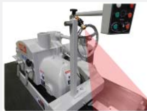
Optional laser light