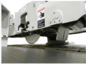
Eight hold-down rolls over 6 rows

The Cantek SRS330 Straight Line Glue Joint Rip saw is a single-blade rip saw is geared towards the shop looking to increase efficiency in their ripping operations but cannot justify a multi-blade rip saw. With its precision cast iron chain and track assembly, and extended pressure section, the SRS330 can produce a glue joint finish ready for panel glue-up right out of the saw.