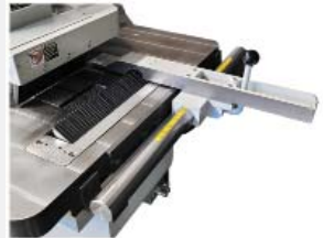
Cast iron fence assembly