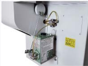
Automatic mechanical lubricator