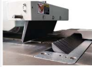
Three rows of anti-kickback fingers