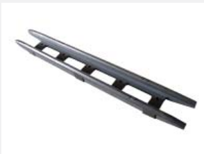
Cast iron chain track (raceway) with double V rails