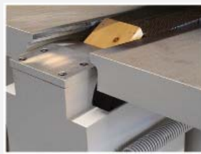
Swing down rear table