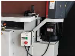
Powerful 3HP motor with oscillation gearbox