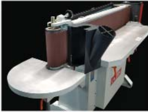
Cast aluminum end table for curve sanding