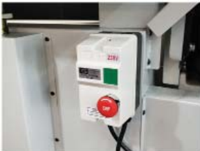
CSA/UL magnetic switch