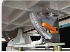
Tilting table with angle scale