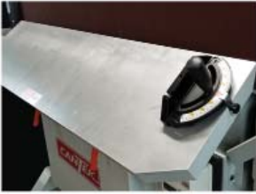
Cast aluminum tilting table from -5° to 45°

The Cantek PW120E Oscillating Edge Sander is designed for the most demanding sanding applications. With its powerful 3HP motor it can perform under industrial requirements. The oscillating belt ensures optimum sanding quality and extended belt life. Its versatility lies in the number of functions which can be done on this single machine. The industrial cast aluminum table can be easily tilted with positive stops of 45° and -5° so you can easily sand straight or miter edges. Additionally, the front table is spring loaded making it effortless for the operator to set the table height in order to utilize the full sanding belt. The 9" high sanding belt makes it ideal for sanding thicker furniture parts or drawer boxes. The additional tiltable cast aluminum end table with removable guard allows for inside contour sanding.