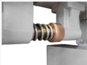
Belt tensioning knob for quick belt changes