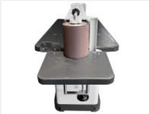
Front and rear tables allow for two parts to be sanding at the same time (tiltable to 45°)