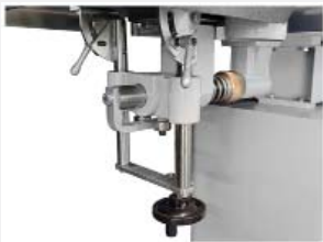
End table height and tilt adjustment