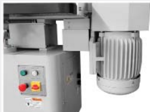
Powerful 10HP sanding motor with oscillating gear box