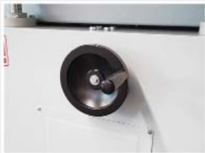
Table adjustment handwheel on front and rear tables