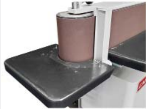
End table with hood removed for curve sanding. (tiltable to 45°)