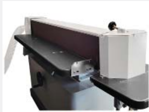
Dual dust ports and belt tracking knob

The Cantek OES Series Heavy Duty Oscillating Edge Sanders are the ideal edge sander for demanding applications for production use. Equipped with a 9" or 12" high oscillating sanding belt, it is ideal for sanding drawer boxes, doors, furniture components and more. The OES Series is also equipped with dual front and rear tables which are adjustable up & down and can be tilted to 45°, allowing for a wide range of applications and for full utilization of the sanding belt. The dual tables also allow for two operators to be working on the machine at the same time made possible by the powerful 7.5 HP or 10 HP sanding motor. The adjustable and tiltable end table allows for sanding of curved components on the idle pulley. The belt oscillated up and down which helps in keeping it cool while also producing an optimum sanded finish.