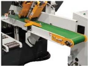
Urethane feed conveyor

The Cantek HR300PBX tilting bed horizontal band resaw is industrially built for demanding resawing applications. The bed can be tilting from 0–45° making it ideal for bevel siding, moulding blanks, or millwork components. Capable of feeding up to 11.8" x 11.8" timber and cutting up to 10" thick. The powerful 30HP saw motor has a variable feed control allowing you to match the cutting speed to your blade & application requirements. The HR300PBX runs a 2" wide blade which runs on solid steel band wheels which are precision machined and balanced for a smooth cutting action. The precision sandwich style blade guides ensure the blade runs true for optimum cutting results. The thickness is conveniently adjusted using a precision motorized digital thickness control.