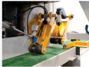
Pneumatic top hold down pressure rollers