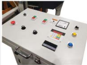
Mobile control panel