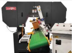
45 degree tilt