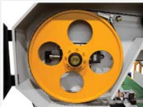
Solid steel bandwheels