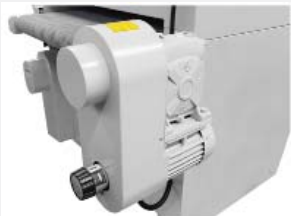
Variable speed motor