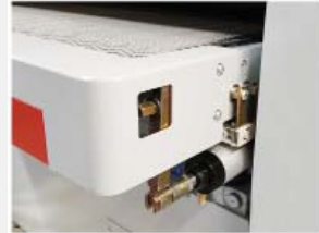
Conveyor belt tracking