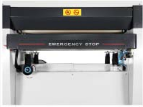
Four elevation screws

The Cantek C371 36" Widebelt Sander is compact and versatile with a combination sanding unit for calibration and final sanding. The robust sanding unit and heavy-duty frame ensures optimum sanding results. Motorized thickness adjustment with digital thickness control for fast and accurate table adjustment.