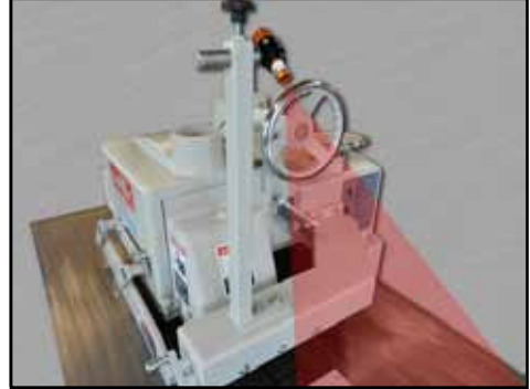
LASER LINE (OPTIONAL) Provides for quick and convenient positioning of cut which also reduces material waste