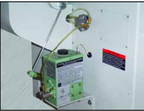
MECHANICAL CHAIN LUBRICATION Lubricant flow rate can be adjusted automatically with the caterpillar chain feed speed variation. When lubrication runs out the chain stops automatically preventing damage to the machine.