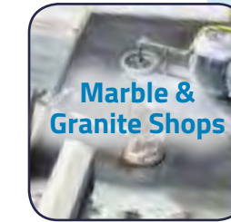
Marble & Granite Shops