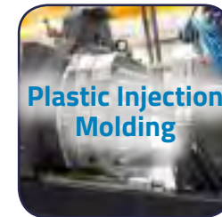
Plastic Injection Molding