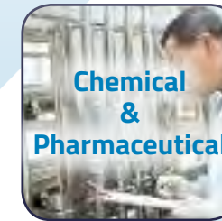
Chemical & Pharmaceutical