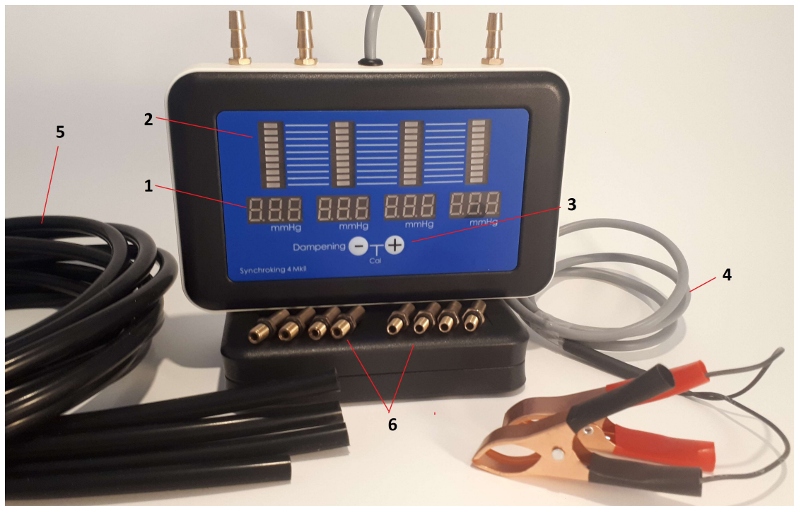
Figure 1 - Device Overview