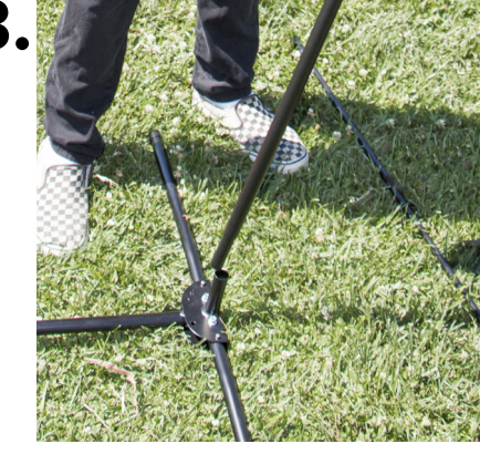
3. Insert one lower (thicker) bar into post at base leg. Repeat for other side.