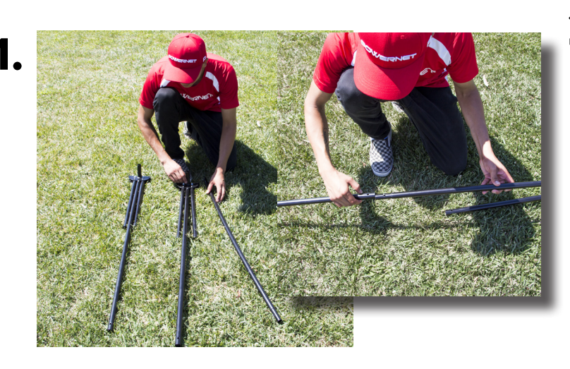
1. Attach middle bar into both ends of the base legs.

(1) NET (2) BASE LEG (2) LOWER POLES (2) UPPER POLES (1) MIDDLE BAR (4) GROUNDSTAKES (1) BAG