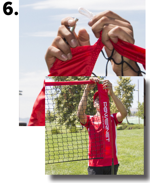
6. Slide net sleeve up and attach white loop on net to silver notch on pole. Repeat for other side.