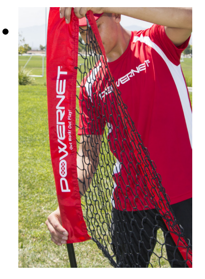
4. For one side, slip net sleeve over one lower bar. NOTE: The end with the white loops will be at the top. Repeat for other side.