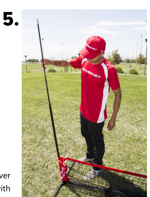
5. For one side, insert one fiberglass pole into lower bar. Repeat for other side.