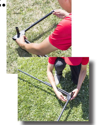
2. Open outer legs and snap into place for both sides.