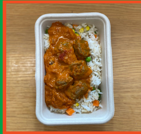
BEEF MEATBALL MASSAMAN CURRY