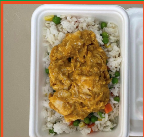
CHICKEN SATAY ON RICE