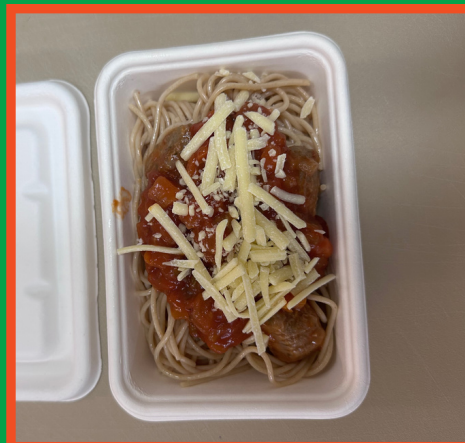
SPAGHETTI & MEATBALLS