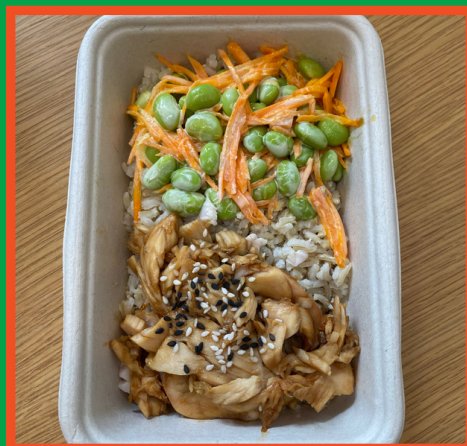
CHICKEN POKE BOWL