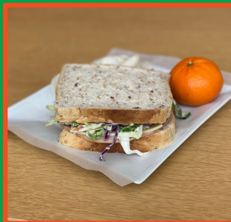
HAM & SALAD SANDWICH FRUIT