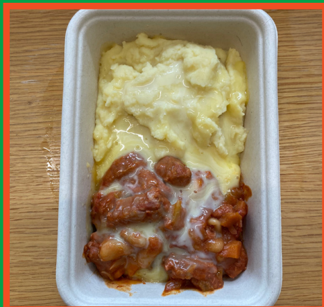
BEEF & CANNELLINI BEAN STEW ON MASH