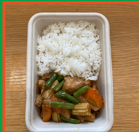
CHINESE 3 CUP CHICKEN