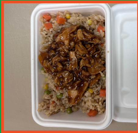
MONGOLIAN CHICKEN ON RICE