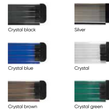
Crystal black Silver Crystal blue Crystal Crystal brown Crystal green