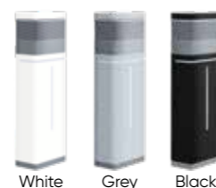
White Grey Black