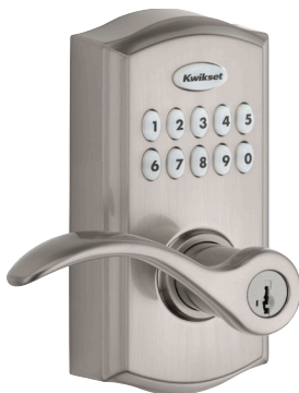
99550-002 Satin Nickel 15