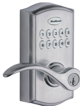
99550-001 Satin Chrome 26D