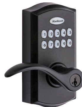
99550-004 Matte Black 514

FINISH AND LIFETIME WARRANTY MECHANICAL THREE YEAR ELECTRONIC WARRANTY