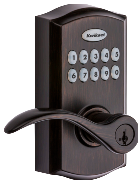
99550-003 Venetian Bronze 11P