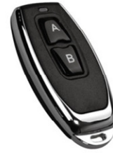
SDC P/N: WRC-2B