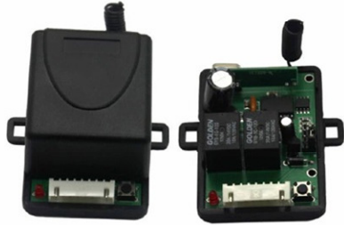
SDC P/N: WRC-R2 or WRC-R2-12