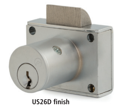
Vertical-hand (VH) drawer