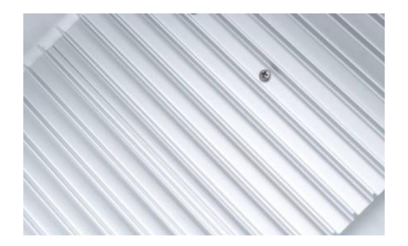
made by high purity aluminum material with high thermal conductivity