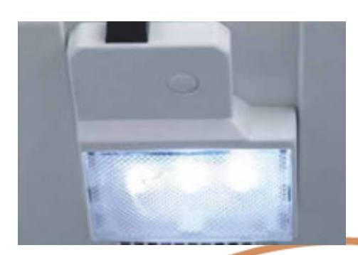
Door-control LED internal light with lower rated power