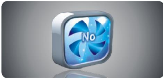
Fan-less cooling system