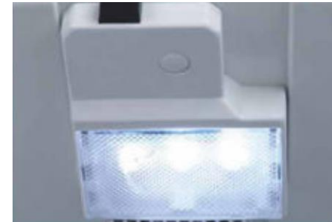
Door-control LED internal light with lower rated power