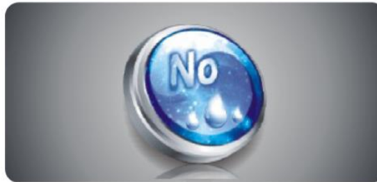
Intelligent frost free system