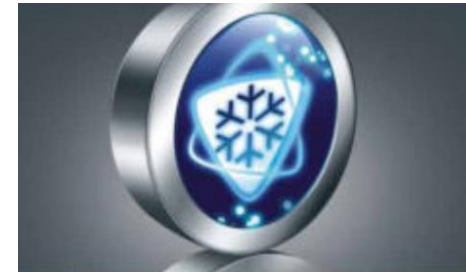
good cold preservation & low energy consumption