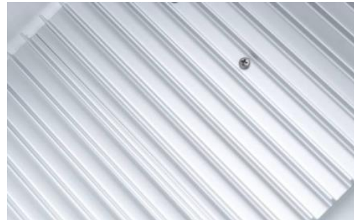
made by high purity aluminum material with high thermal conductivity