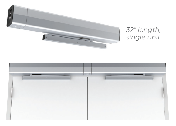
Full-length, modular backplate and cover spans a pair of doors