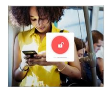
Mobile App Control Unlock, lock, or check door on your smartphone