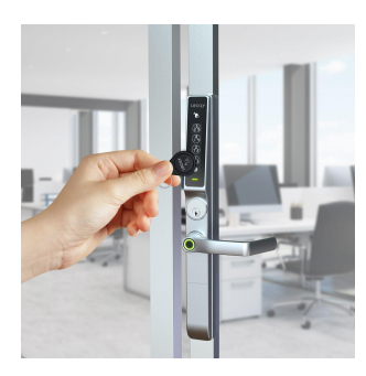
RFID / Fob Key Access Fast and secure access, stores up to 999°s fob keys or RFID cards.