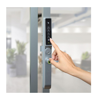
Hack-proof digital Keypad Generate and stores up to 52 access codes with specific profiles and permissions