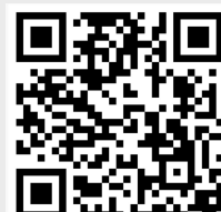
Watch installation video