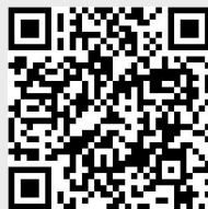
Download door drilling template