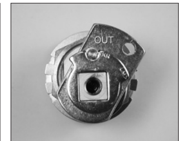
Figure 9 (key retaining)