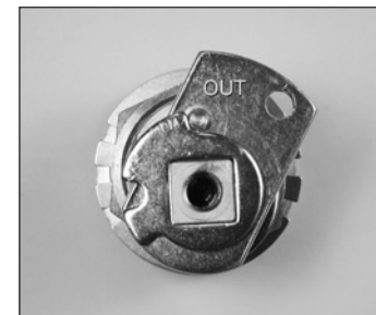
Figure 8 (non key retaining)

Please Note: To correctly synchronize the lock it must be assembled without a key inserted and the cam pointing up in the locked position. (Figs. 8 & 9) Finally, all is secured using the supplied retaining screw.