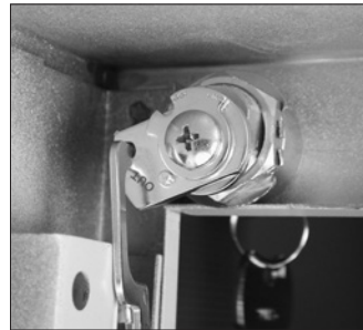
Figure 12 (unlocked)