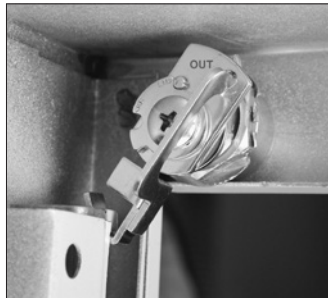
Figure 11 (locked)