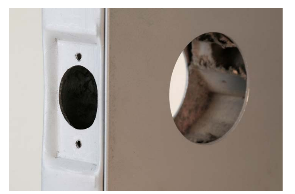
Lock prep with faceplate indention made by our Pit Bull tool. The HIT-24 will also work if you use a cut out and mounting brackets.