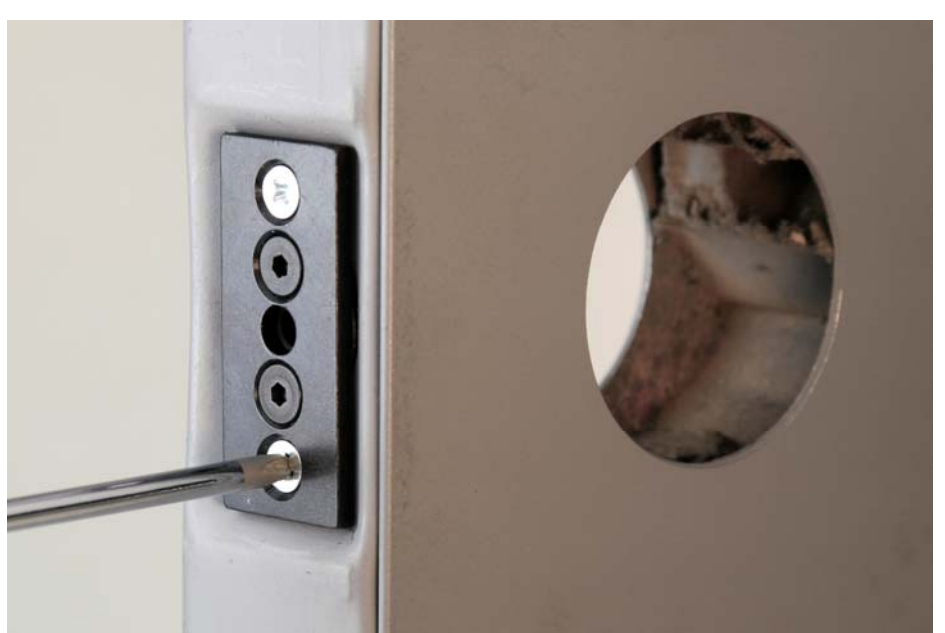
HIT-24 guide being mounted in door. Use the mounting screws supplied with the lock being installed to hold in place.