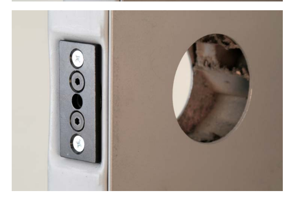
HIT-24 guide mounted in door.