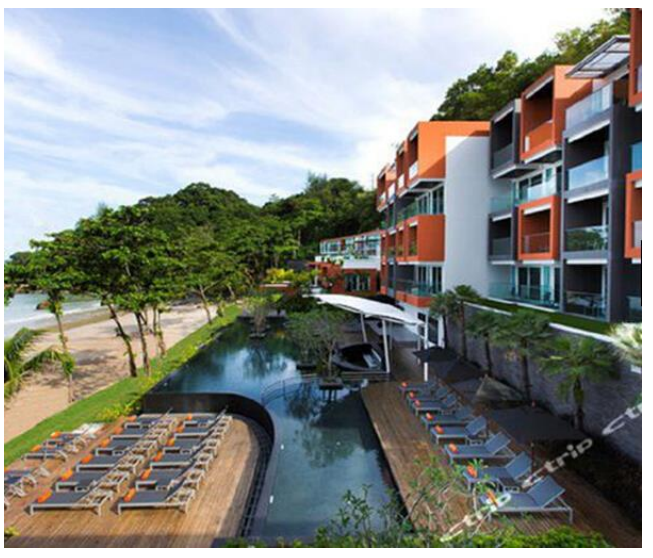
Novotel Comcala Beach, Phuket, thailand 180 rooms