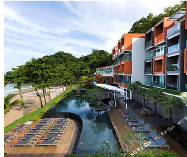
Novotel Comcala Beach, Phuket, thailand 180 rooms