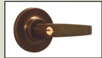
Imperial Standard trim in 613