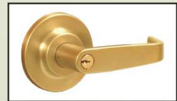
Imperial Standard trim in 606