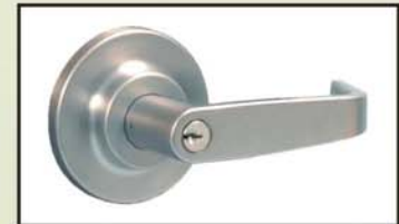
Imperial Standard trim in 626