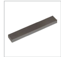
10FILLER34UL 0.75 × 0.75 INCH FILLER PLATE