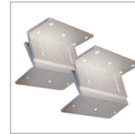
10MAG5LZUL (2) L & Z BRACKET FOR 1200 LB, DOUBLE