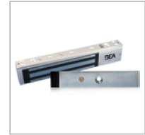
10MAGLOCK1ULDS 1200 LB, SINGLE