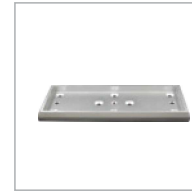
10RIMHOUSING3UL ARMATURE PLATE HOUSING, 600 LB