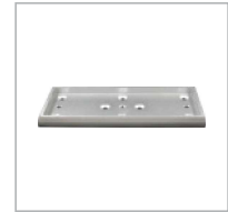
10RIMHOUSING1UL ARMATURE PLATE HOUSING, 1200 LB