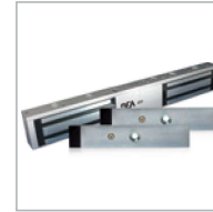
10MAGLOCK6ULDS 600 LB, DOUBLE