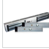
10MAGLOCK5ULDS 1200 LB, DOUBLE