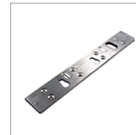
10SPACER1UL VERTICAL SPACER BRACKET, 1200 LB