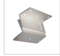
10LZBRMAG1UL L & Z BRACKET FOR 1200 LB, SINGLE