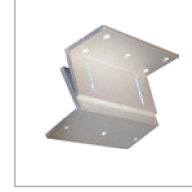
10LZBRMAG3UL L & Z BRACKET FOR 600 LB, SINGLE