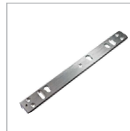
10SPACER3UL VERTICAL SPACER BRACKET, 600 LB