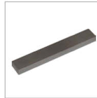
10FILLER14UL 0.25 × 0.75 INCH FILLER PLATE