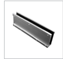
10UBRACKETUL GLASS DOOR MOUNTING KIT