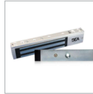
10MAGLOCK3ULDS 600 LB, SINGLE