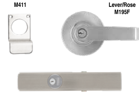
Cylindrical Dogging Kit - 32D M9901, M9902