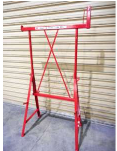
FIG. 1 SCAFFOLD TRESTLE TEST ITEM