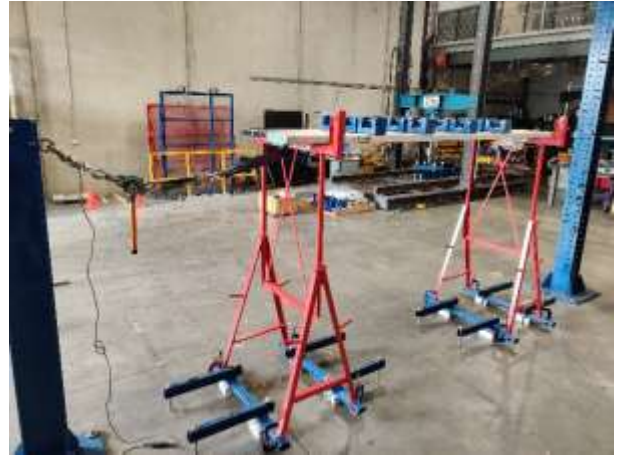
FIG. 4 "MODIFIED STIFFNESS TEST" LATERAL TEST ARRANGEMENT

A pair of fully extended, 1.8 metre high scaffold trestles were positioned 2.5 metres apart, with the working platform width fully planked using extruded aluminium alloy scaffold planks. Both trestles were fixed at each foot to a rigid horizontal foundation. Using 10 kg steel weights, a total mass of 120 kg was applied uniformly over the planked-out surface area (see Fig. 4).