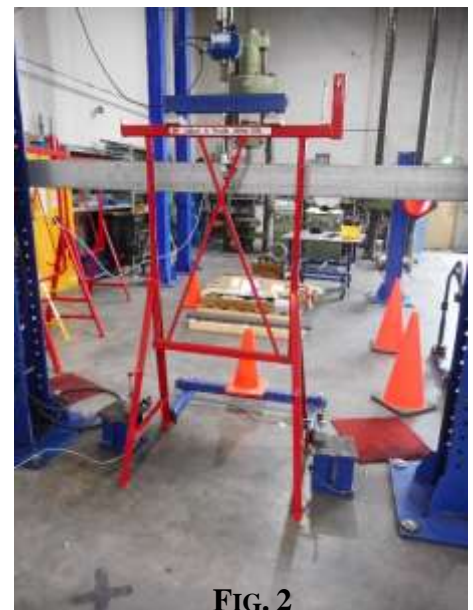
FIG. 2 STRENGTH TEST SET-UP

As per the procedure in APPENDIX A.5.3, prior to testing, a settling load commensurate to 25% of the Working Load was to be applied for 60 seconds and removed. A pre-load of 100 N was then to be applied to the test item to establish a zero point. The test load was then to be progressively increased to the required load and continuously applied for five (5) minutes. The test load was then reduced to 100 N and the permanent deformation was recorded. This process was repeated for each of the three (3) required tests; Working Load ( P_w ), Design Load ( P_D ) and Minimum Strength Load ( P_M ). Testing was to be conducted on three (3) repeat test samples, as required by CLAUSE A.5.1.